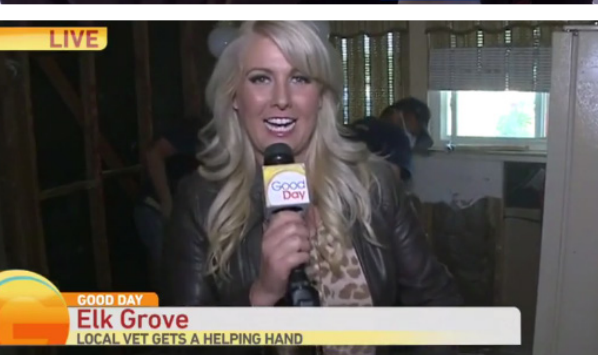
GOOD DAY Elk Grove LOCAL VET GETS A HELPING HAND