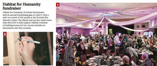
Habitat for Humanity fundraiser Habitat for Humanity of Greater Sacramento held its annual fundraising gala on April 9 with a sold-out crowd of 350 people at the Scottish Rite Masonic Center. The dinner and auction raised more than $110,000 to help support Habitat's mission of building homes for low-income families in Sacramento and Yolo counties.