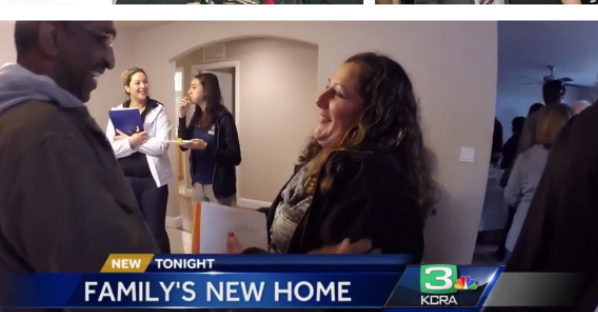
NEW TONIGHT FAMILY'S NEW HOME